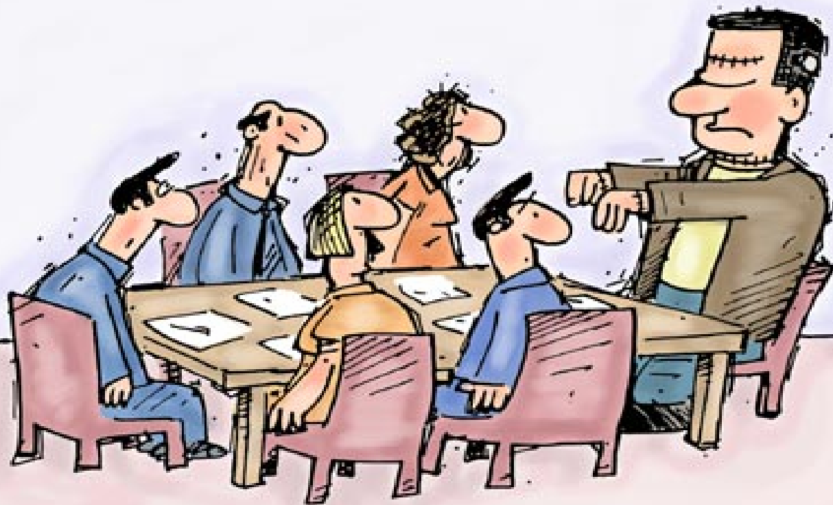
THE BODY PARTS IMPLANTS ETHICS COMMITTEE